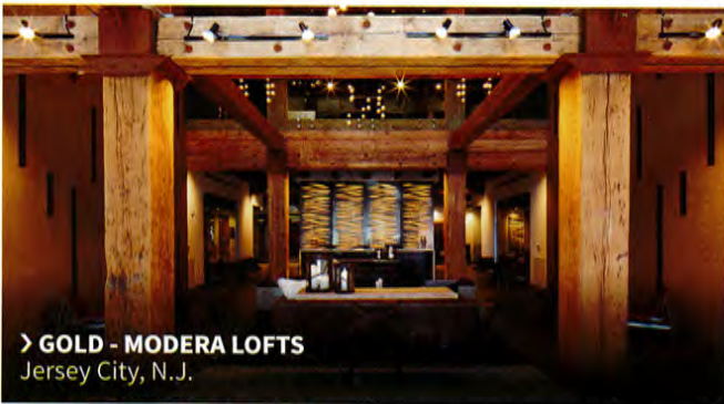
› GOLD - MODERA LOFTS Jersey City, N.J.

Architect/Designer Brown Lindquist Fenuccio & Raber Architects, Inc. Developer Dennis Community Housing Preservation Association Builder Delphi Construction, Inc. Land Planner Horsley Witten Group