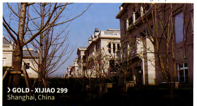
› GOLD - XIJIAO 299 Shanghai, China

Architect/Designer Minno & Wasko Architects Land Planner Melillo & Bauer Builder Mill Creek Residential Trust Interior Merchandiser Cube 3 Studio Interior Designer Cube 3 Studio Developer Mill Creek Residential Trust