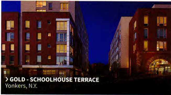
› GOLD - SCHOOLHOUSE TERRACE Yonkers, N.Y.

Architect/Designer Miller Slayton Architects Developer Anthem Builders and Saigebrook Development Builder Pinroc Construction, LLC Interior Merchandiser 5G Studio Collaborative Interior Designer 5G Studio Collaborative Photographer Bright & Early Productions