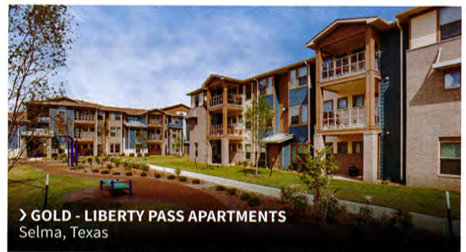
› GOLD - LIBERTY PASS APARTMENTS Selma, Texas

Architect/Designer Schwarz Lewis Design Group Developer AMLI Development Company Builder Walsh Construction Land Planner Blue Stem Design, Inc. Interior Designer Hartshorne Plunkard Architecture Photographer Eric Hausman Photography