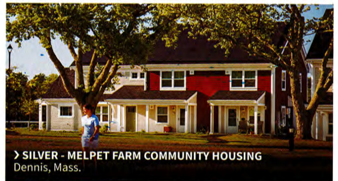
› SILVER - MELPET FARM COMMUNITY HOUSING Dennis, Mass.

Architect/Designer Magnusson Architecture and Planning PC Developer The Community Builders, Inc. Builder Sisca N.E.-MPCC-Mengler JV. II, LLC Photographer Ari Burling Interior Designer Magnusson Architecture and Planning PC